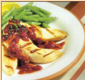
Cranberry Ginger Marinade